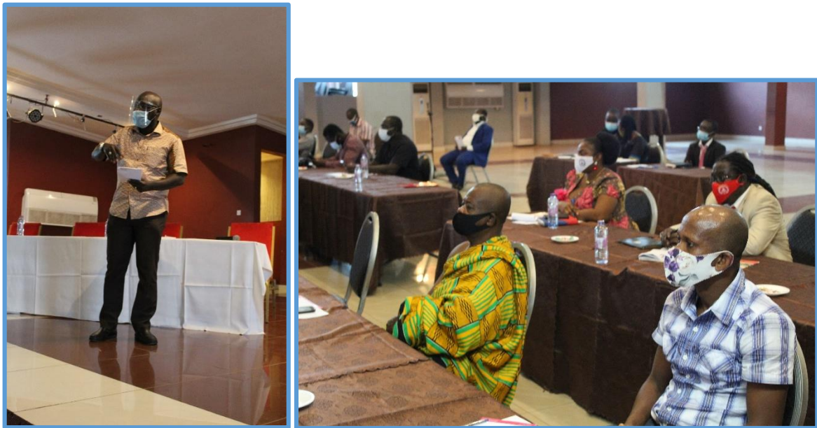
Some pictures from the regional forum held in Sunyani