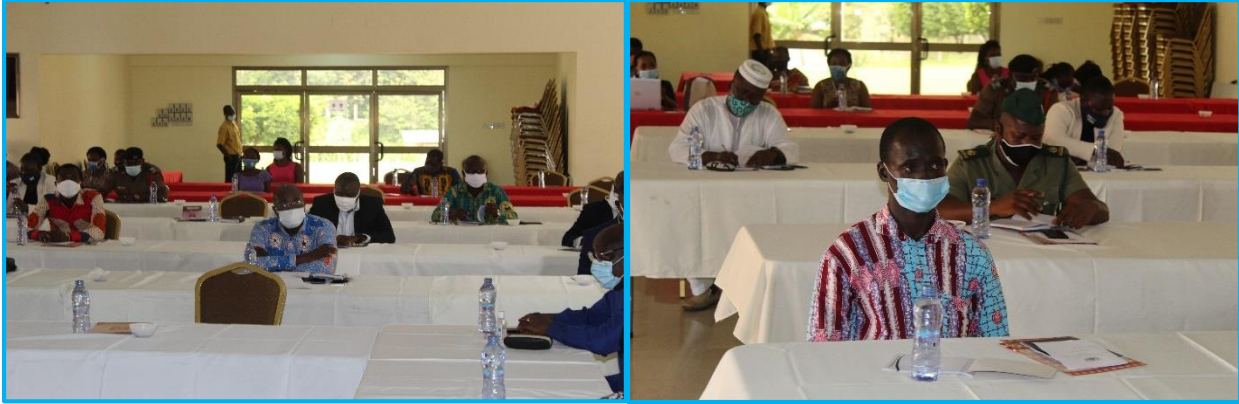
Some pictures from the regional forum held in Cape Coast