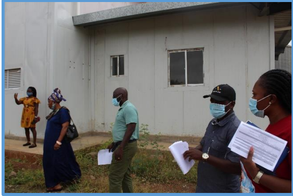
Some pictures from the inspection of a 1000 Metric Tonne Warehouse at Sunyani.