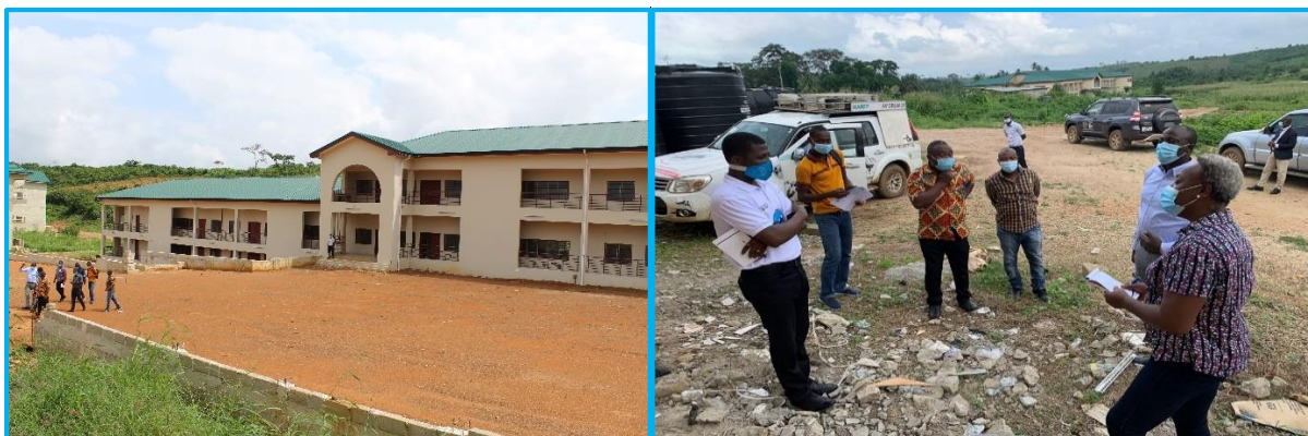
The PIAC team inspected ongoing works at the Anomabo Fisheries College in Cape Coast.

Most of the district engagements were preceded by in-studio radio discussions, which informed the public about the work of PIAC.