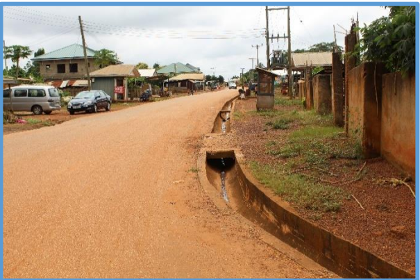
The construction of the Sunyani By-pass: Outer Ring Road (Kumasi – Berekum Road) was also inspected by the PIAC Team in 2020