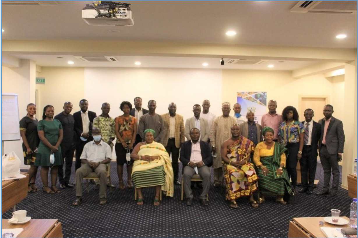
Participants after the PIAC General Assembly