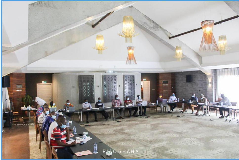
Editors and news editors in one of the sessions at the forum