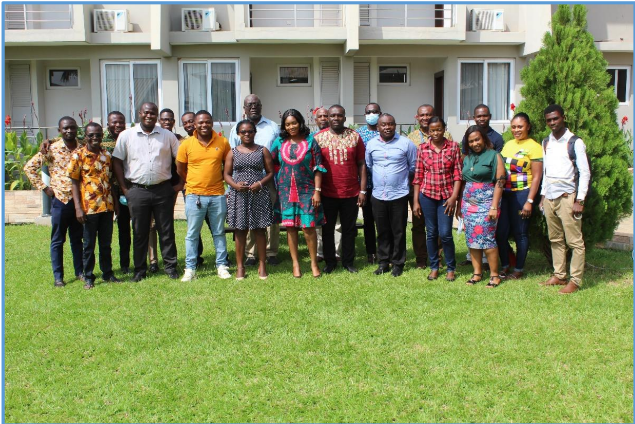
Some members of the PIAC team and the media after the engagement.

The Committee held an end of year meeting with its media stakeholders to assess the relationship in the year under review and to chart a formidable path for an improved partnership in the coming year. Discussions focused on a review of PIAC and the Media in 2020, what PIAC expects from the media and vice versa.