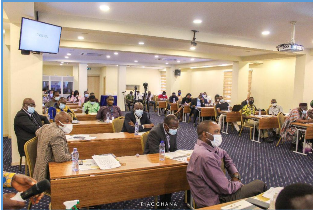
Some of the participants in the forum

2.5.2 Report of Meeting with the Finance Committee of Parliament Members of the Committee met with the Finance Committee of Parliament to discuss PIAC' s 2019 Annual Report as well as seek clarifications on issues raised.